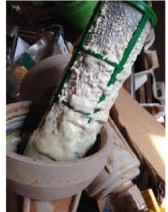
Can this mess be avoided?