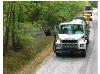
What is the fate of roadside applied herbicides?